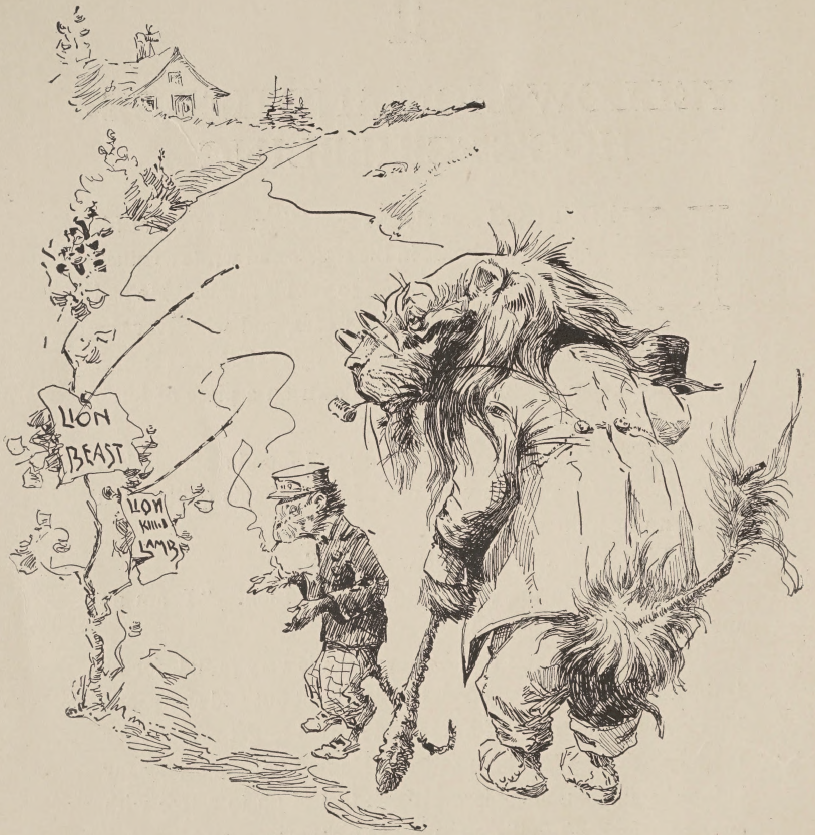
LITTLE MONKEY EXPLAINS.